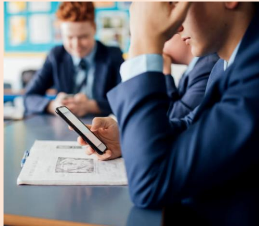
Image sextortion is where the purpose of extortion is to receive indecent images of someone.

Financial sextortion is where the purpose is to gain financially when the victim pays money to stop someone sharing their images.